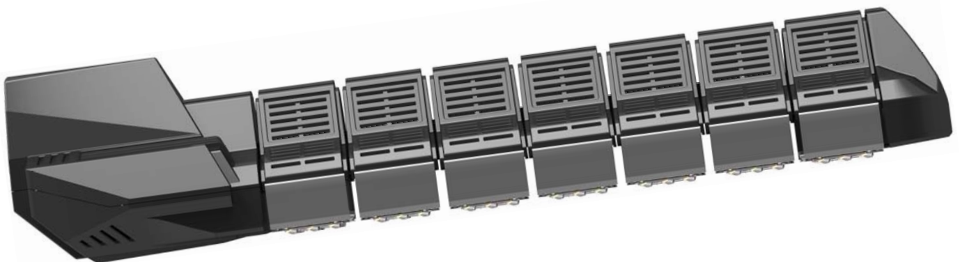
High Power LED Street Light LX-SL168